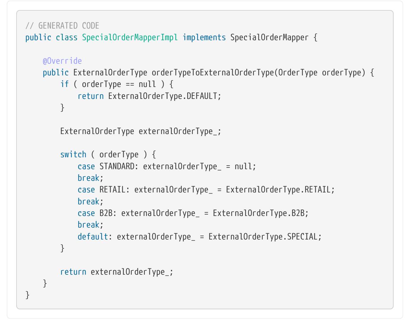
Example 57. Enum mapping method result, <NULL> and <ANY_REMAINING>

Note: MapStruct would have refrained from mapping the RETAIL and B2B when <ANY_UNMAPPED> was used instead of <ANY_REMAINING>.