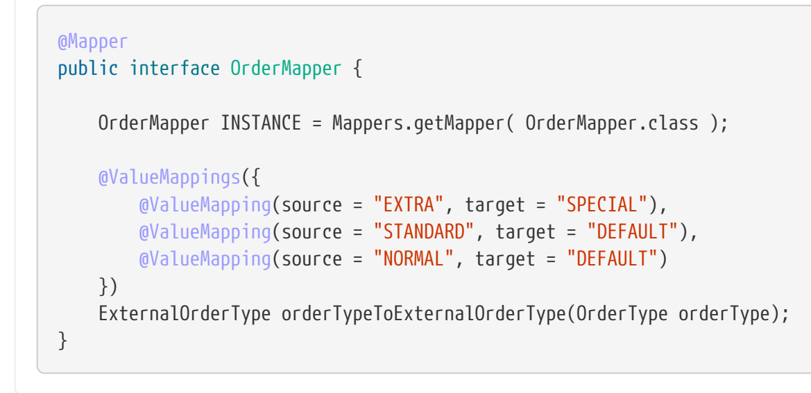
Example 55. Enum mapping method result